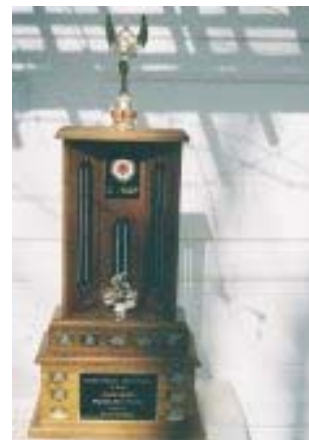
Canadian Female Olympic Goal