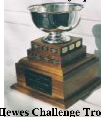
Hewes Challenge Trophy