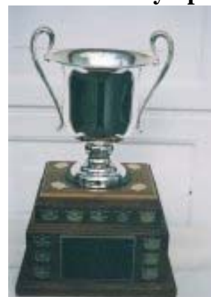
Canadian Male Olympic Goal