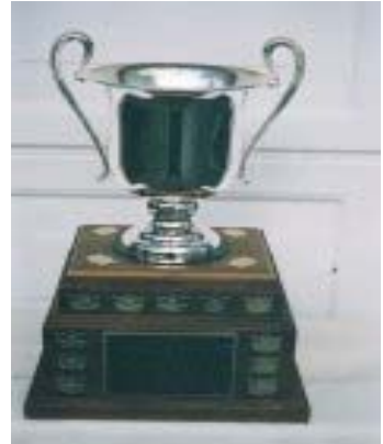
Canadian Male Olympic Goal