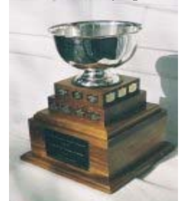
Hewes Challenge Trophy