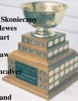
Canadian Female Olympic Goal